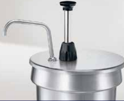
Inset & Pan Pumps