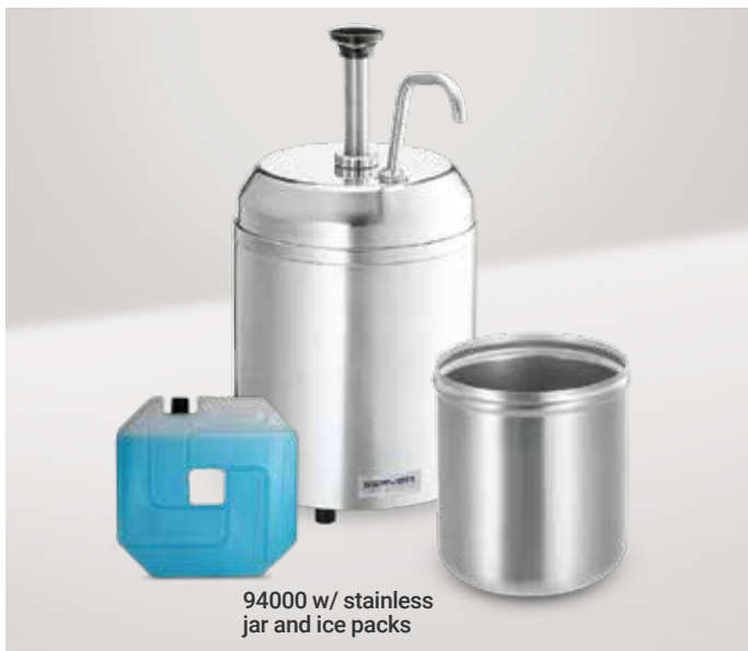
94000 w/ stainless jar and ice packs