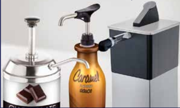
Food Container & Pouch Pumps